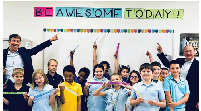
During Hancock Whitney Financial Education Month and Founders Month, we focus on teaching kindergarten through high school students and adults critical financial skills they need to build more secure financial futures.

During Hancock Whitney Founders Month in 2018, associates used Hancock Whitney Financial Cents components and other curriculums to teach time-tested money management strategies to nearly 5,000 people from 75-plus organizations.