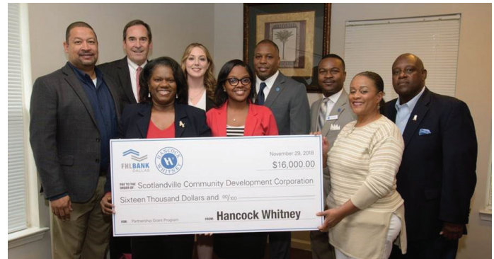
Hancock Whitney partners with organizations such as the Federal Home Loan Bank of Dallas to facilitate affordable housing across our footprint.

In 2018 Hancock Whitney's PYWH program provided several million dollars in mortgage financing.