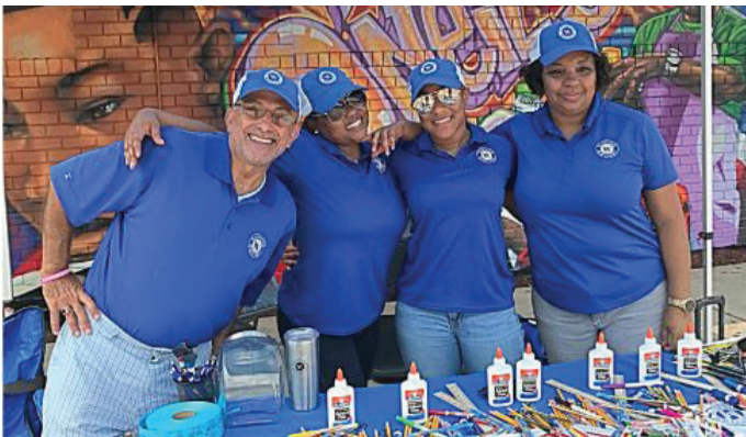
Teamwork is a core value that guides how Hancock Whitney associates serve our clients, our communities and each other every day.

We require all associates to complete compliance training annually. Examples include but are not limited to Gramm-Leach-Bliley Privacy Act, Business Continuity Overview, Ethical Workplace, ID Theft Red Flags Rule, Information Security and Workplace Security. In addition to the courses all associates are required to take, we assign associates a customized curriculum of compliance courses based on their roles to ensure a high level of knowledge of the rules and regulations that impact their areas of responsibility.