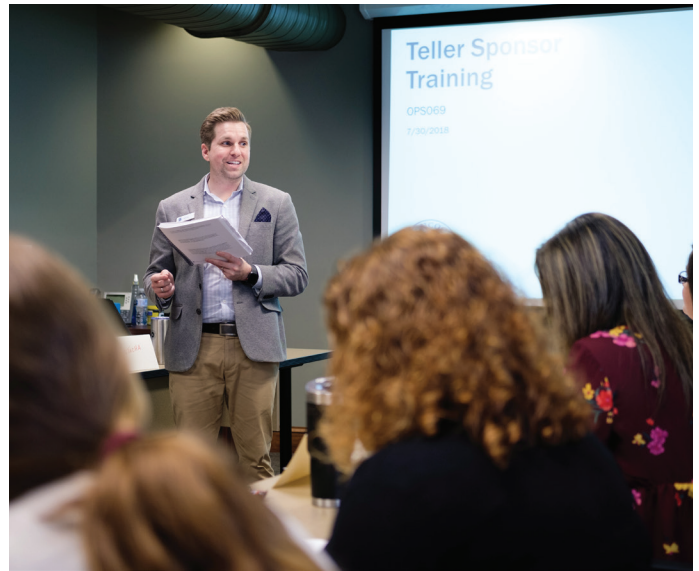
Through various learning and development opportunities, Hancock Whitney offers associates the chance to grow and flourish professionally.

Hancock Whitney requires our leaders to complete courses we feel are critical to their success in our organization. In addition to various internally offered leadership development programs, the company also supplements those programs by selecting associates to participate in banking schools and executive development programs as part of its overall approach to talent management.