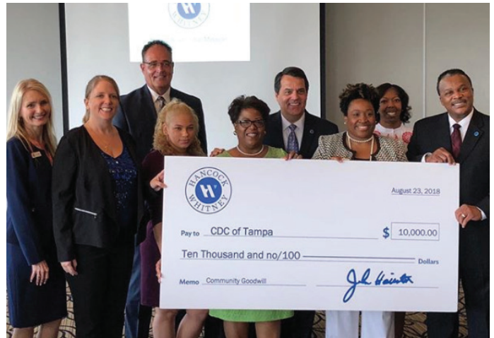
Hancock Whitney invests financial support to ensure affordable housing for the most vulnerable across the Gulf South.

In the last two years, we provided 15,217 small business loans totaling more than $3 billion to help drive economic growth and job creation across the Gulf South.